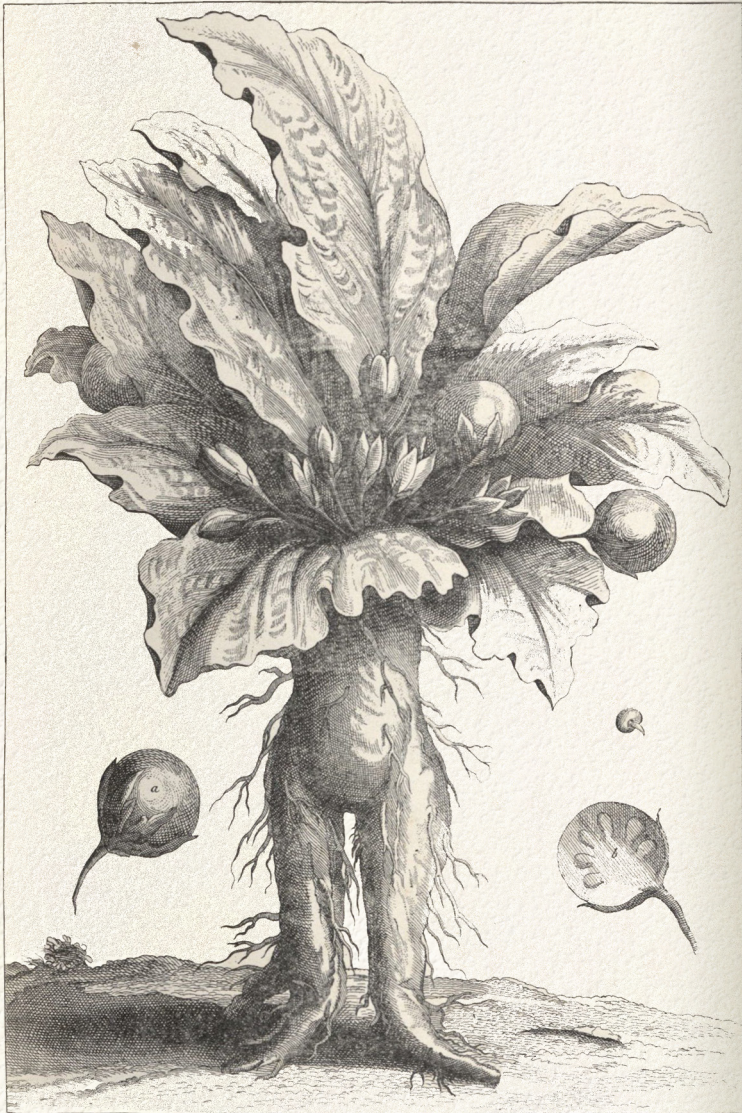
La Mandragore - plante